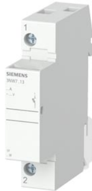
SENTRON, cylindrical fuse holder, 10x38 mm, 1-pole, In: 32 A, Un AC: 690 V