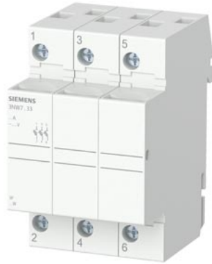
SENTRON, cylindrical fuse holder, 10x38 mm, 3-pole, In: 32 A, Un AC: 690 V