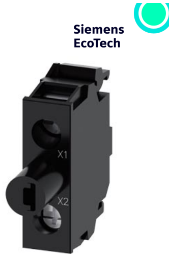
LED module with integrated LED 230 V AC, blue, screw terminal, for floor mounting