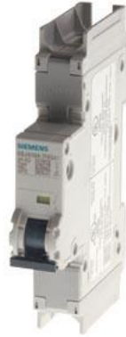
Miniature circuit breaker 240 V 14kA, 1-pole, D, 10A, D=70 mm according to UL 489