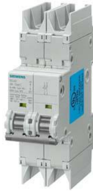
Circuit breaker 10kA, 2-pole, C, 1A according to UL 489-480Y/277V