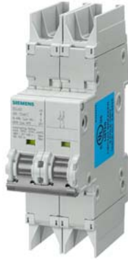
Circuit breaker 10kA, 2-pole, C, 4 A according to UL 489-480Y/277V