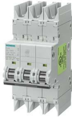
Circuit breaker 10kA, 3-pole, D, 3 A according to UL 489-480Y/277V