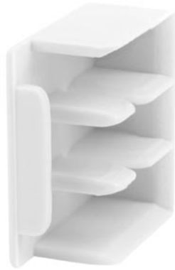
End cap for pin busbars 2-3-phase