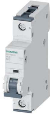
Miniature circuit breaker 230/400 V 10kA, 1-pole, B, 20 A, D=70 mm