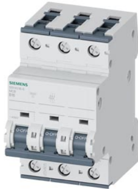
Miniature circuit breaker 400 V 10kA, 3-pole, B, 16A, D=70 mm