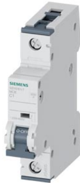
Miniature circuit breaker 230/400 V 6kA, 1-pole, C, 1A, D=70 mm