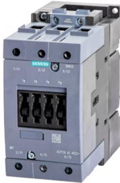
Contactor AC 120 V 50/60 HZ AC3 45 kW 400 V 3-pole, size S3, screw terminal